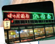
かき舟 Oyster ship