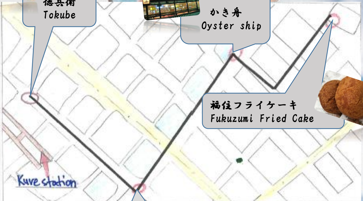
福住フライケーキ Fukuzumi Fried Cake