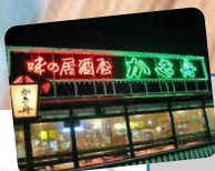
かき舟 Oyster ship