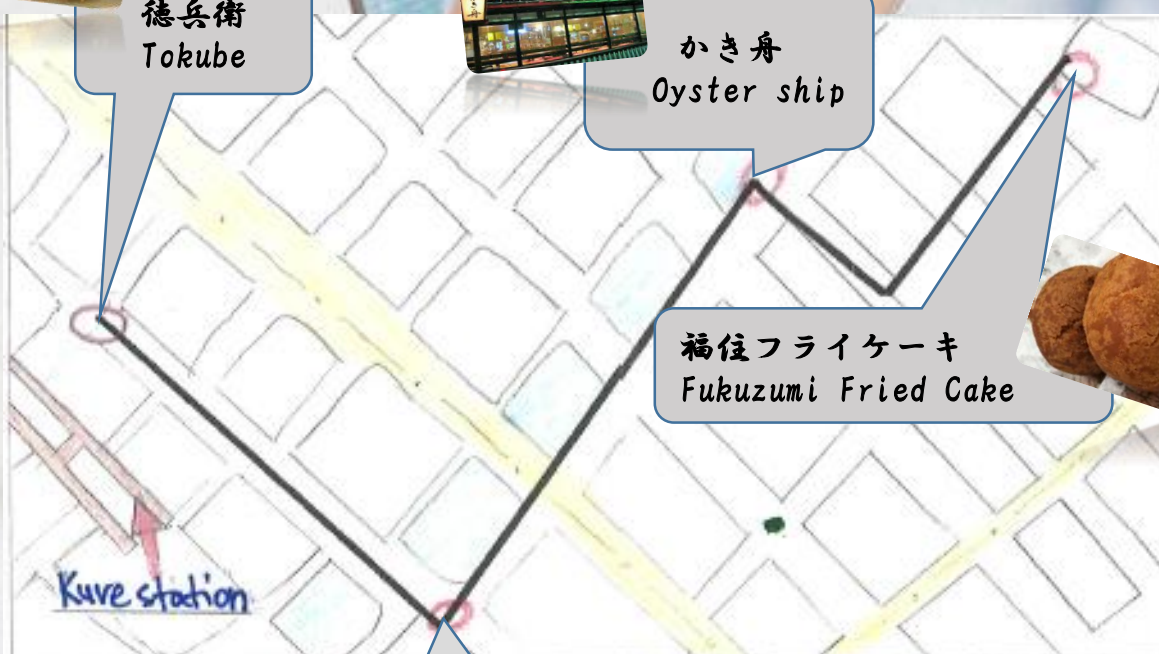
福住フライケーキ Fukuzumi Fried Cake